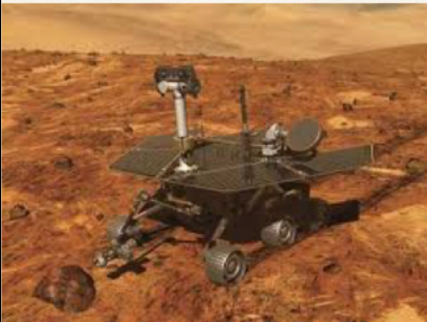
Above: Exploration Rover

It’s amazing, the technology humans come up with and how dedicated we are to exploring the unknown. Even after countless failures, humans continue to build extraordinary spacecraft and technology. Right now there are only unmanned rovers on Mars, but who knows what will happen next.